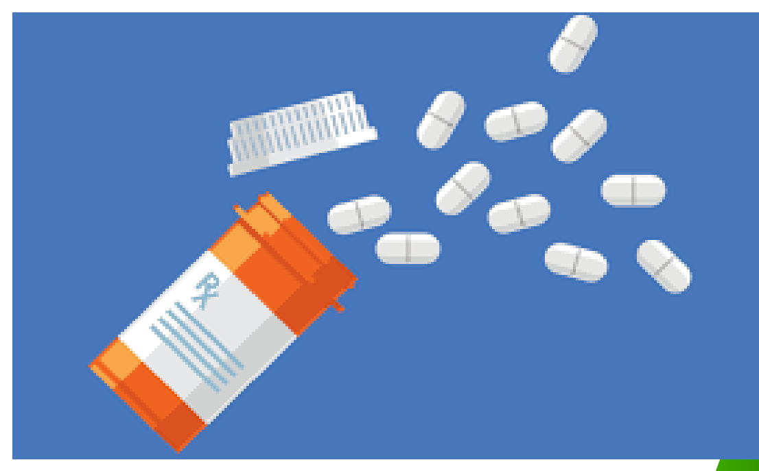
Click image above for form